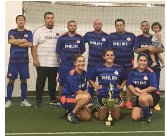
Above Summer 2016 Co-Ed Indoor Soccer Champs Below 2016 Men’s Indoor Soccer Champions