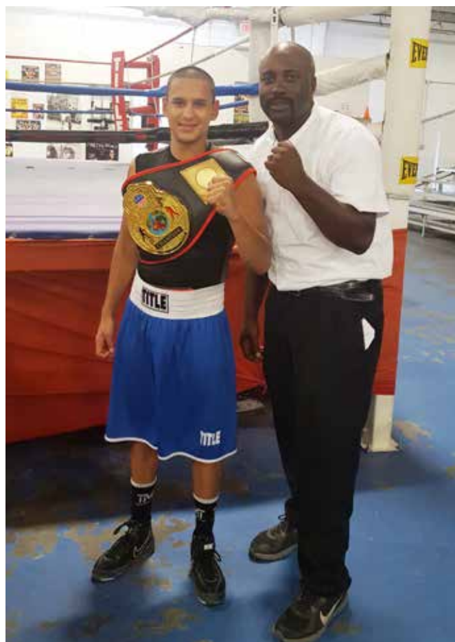
2018 Lemoore Recreation Guide