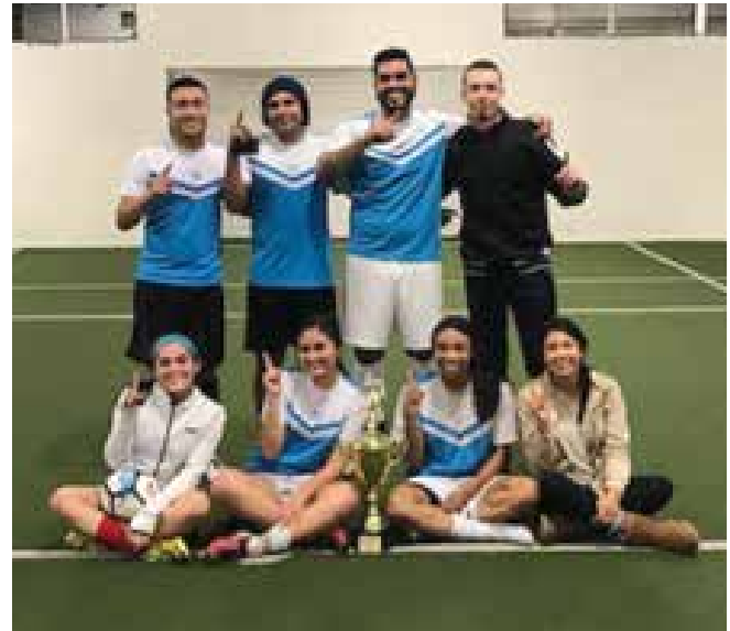
Above Summer 2017 Co-Ed Indoor Soccer Champs Below 2017 Men's Indoor Soccer Champions