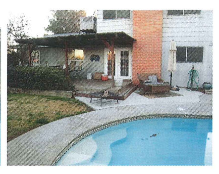
Alarmed back door to home