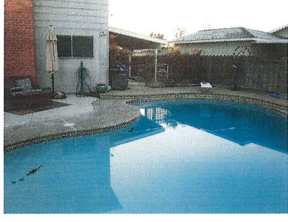
Backyard view of side entrance