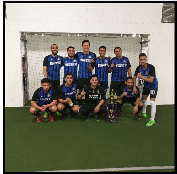
Spring 2018 Men's Champions

Fees: $450 per team / $560 per team with uniforms included.