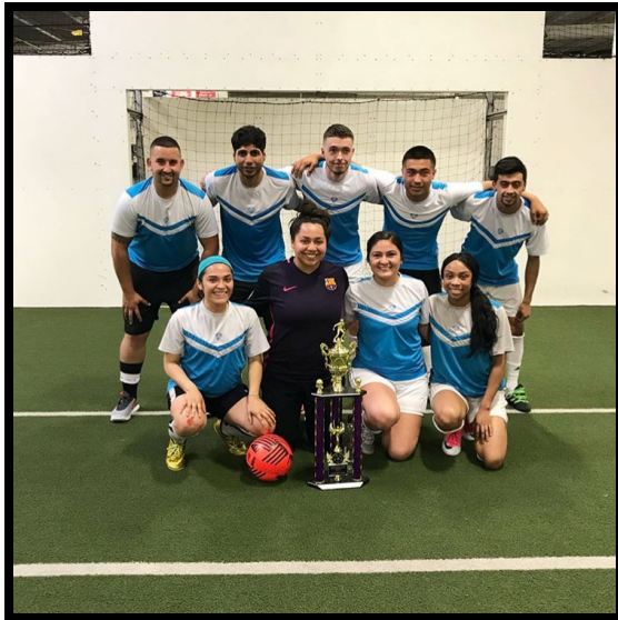
Spring 2018 COED Champions

Men's, Women's and COED leagues are available for sign-up!